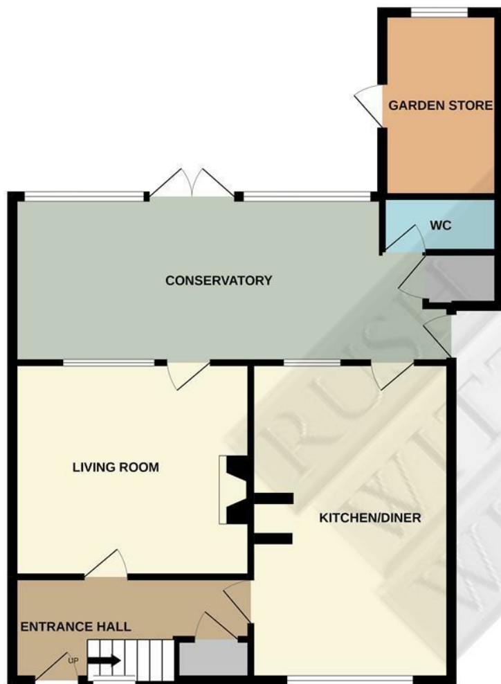
GROUND FLOOR 800 sq.ft. (74.3 sq.m.) approx.