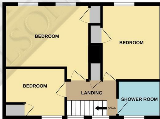
1ST FLOOR 466 sq.ft. (43.3 sq.m.) approx.

TOTAL FLOOR AREA : 1266 sq.ft. (117.6 sq.m.) approx.